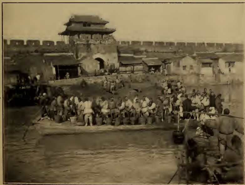
CROSSING THE FERRY.